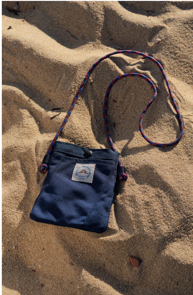
SACOCHE BAG by Epperson Mountaineering