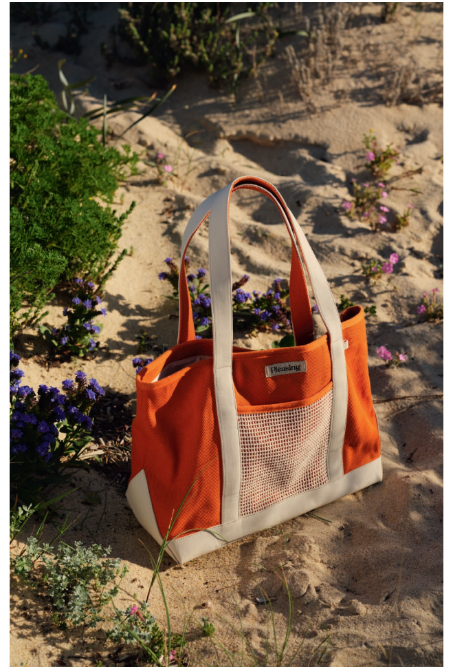
BAG by Pleasing