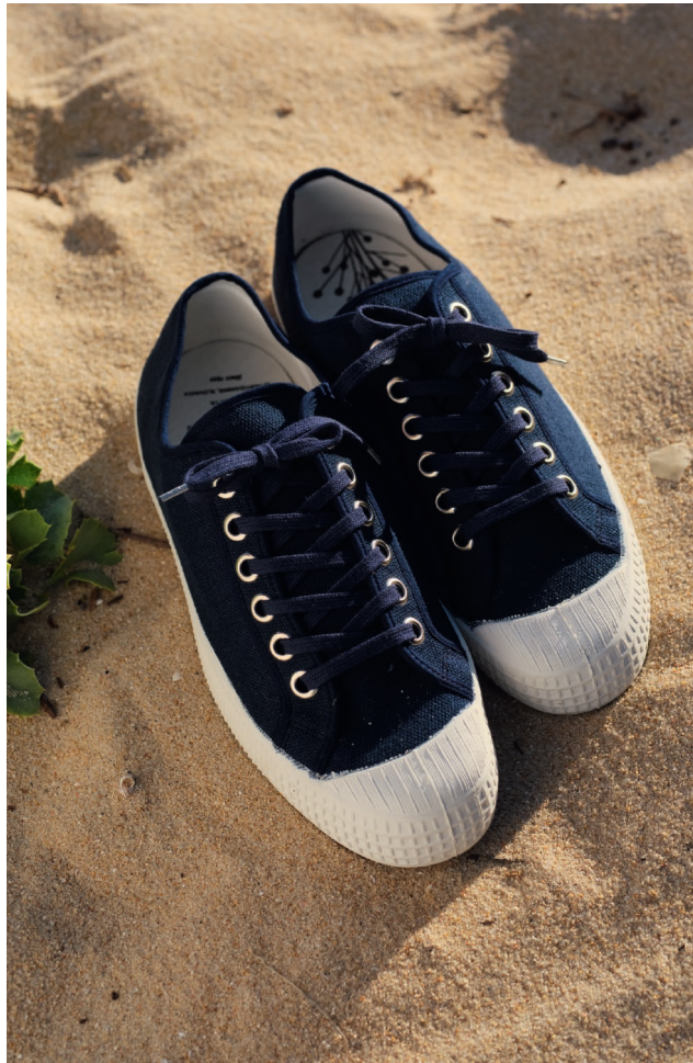
TRAINERS by De Bonne Facture × Novesta