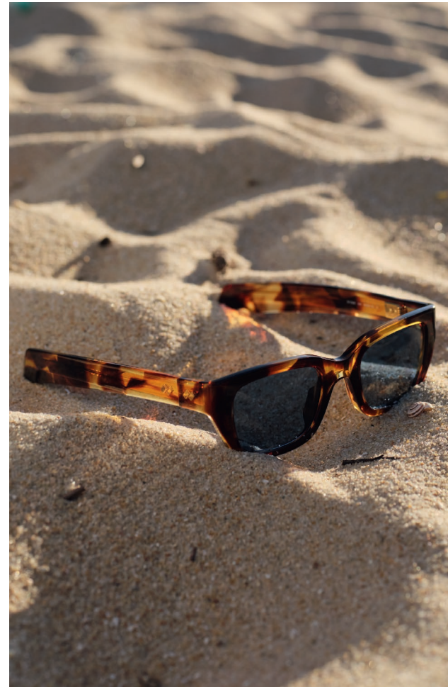
SUNGLASSES by Bottega Veneta