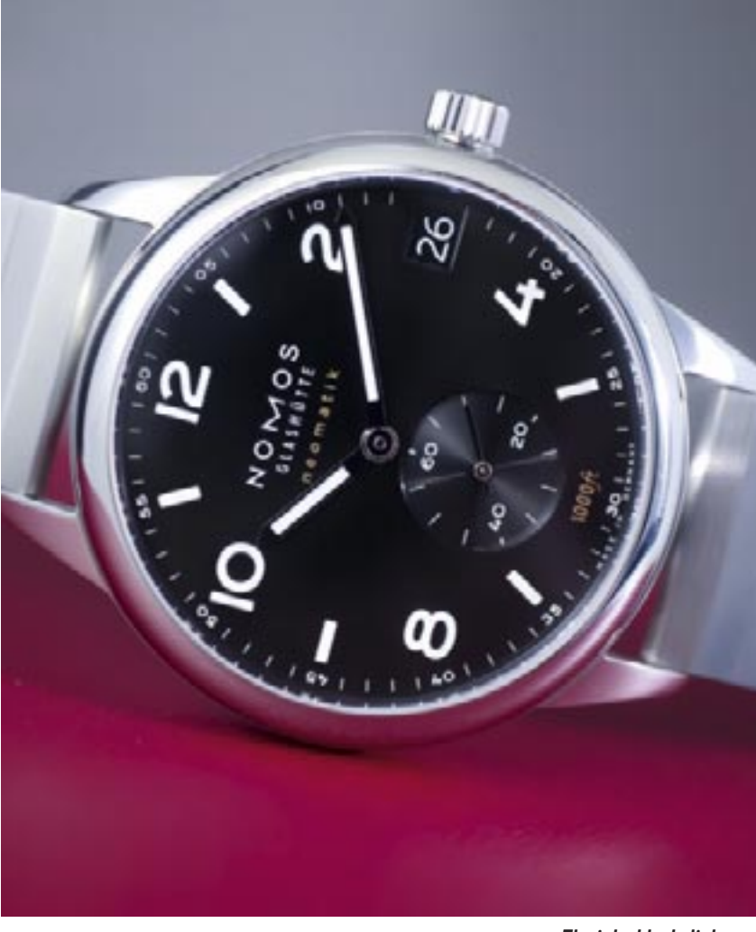
The inky black dial stands out with golden accents and a high level of polish.

What's especially unique about the 6101 for Nomos is that, for the first time, the movement features three different crown positions. At its home position, the watch can be wound by hand if so desired; placing the crown in its second pothe previous generation DUW 3001 as its base, sition allows for the date to be set; finally, when the DUW 6101 was completely redesigned to the crown is fully pulled out, the time can be integrate a large date ring on the outside of the adjusted. The 6101's most remarkable attribute, however, is a quick-change and bidirectional date mechanism that allows you to safely set the date The winding system was reworked from start to both forward and backward. On the Nomos Club finish as well. Despite the 6101's substantial Sport, the date aperture is nicely integrated at 3 width of 35.2 mm with its date wheel (compared o'clock with an all-black background to seam-