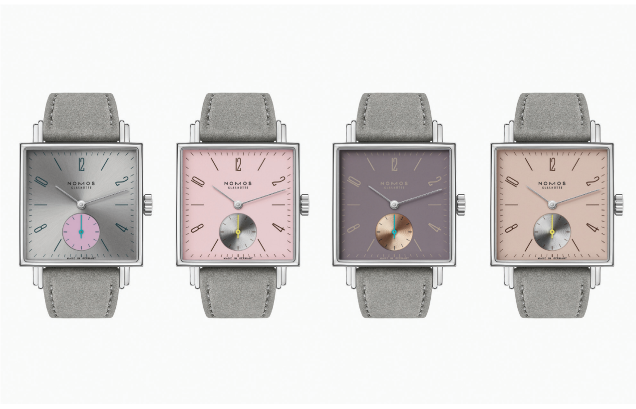
All four Tetra watches feature a square case that is 29.5mm by 29.5mm with a slim 6.3mm height

an elegant pink color palette designed by Thomas Höhnel. Throughout the years that followed the very first release of the Tetra, the watch has seen a wide range of interesting, and even controversial, colorways. With different shades of pink and subdued neutral tones, Höhnel's new palette for the watch are a first for the Tetra series.